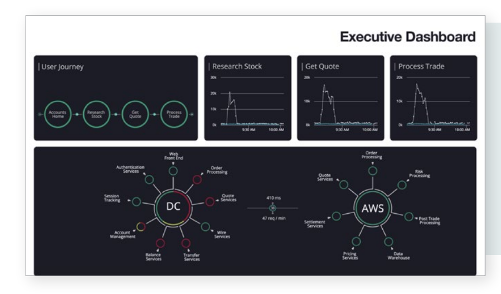
Figure 4: Executive Dashboard showing the performance and health of all applications. Business Intelligence metrics are displayed next to Application Performance metrics.

BiQ provides code-level visibility into an agency's application-based operations. We call this the "business journey," and it includes all the many distributed events and back-end processes required to execute a business or operations process. Examples of a business journey might include a loan approval, a benefits eligibility determination, the intake and processing of a grant application, the onboarding of a new employee, a cargo inspection, fleet maintenance scheduling, or a visa application. BiQ sees how individual events and processes are performing, understands normal baseline activity, flags anomalies in performance or behavior, and quickly spots bottlenecks or friction points that can be further optimized for improved program or mission outcomes.