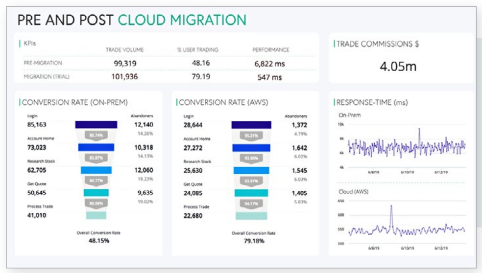
Figure 1: AppDynamics screenshot showing the performance of an application pre- and post-cloud migration.

AppDynamics helps agencies minimize the risks associated with cloud migrations by providing in-depth performance baselines of applications before and after a migration (see Figure 1) to ensure application availability and performance service level agreements (SLAs) are honored and that any performance gaps are quickly identified and rectified.